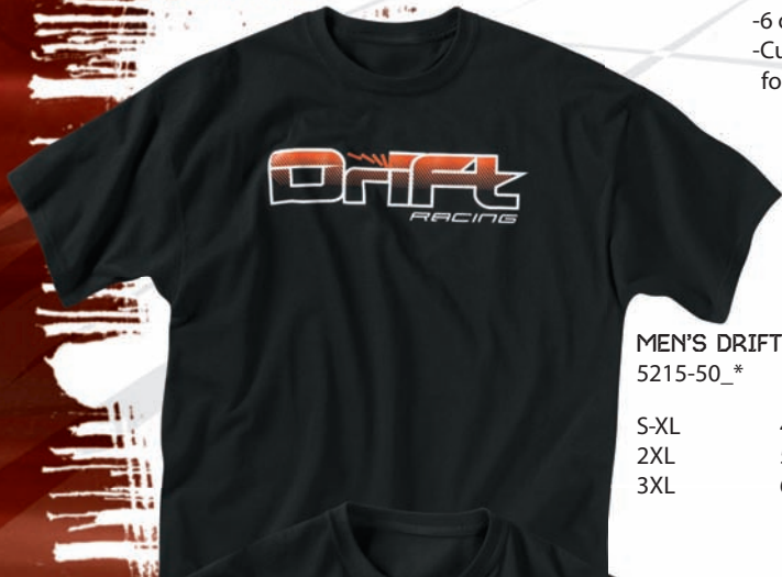
MEN'S DRIFT RACING 5215-50_*