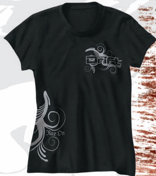
DRIFT GIRL JUNIOR-SIZE TEE