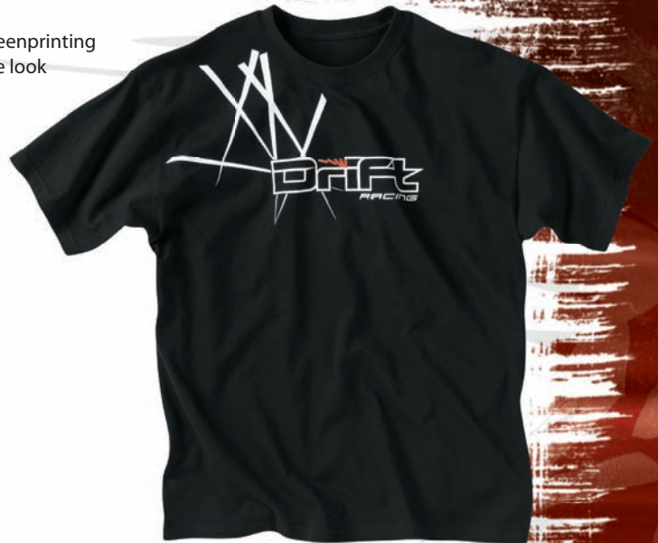
MEN'S DRIFT INTIMIDATOR 5215-53_*