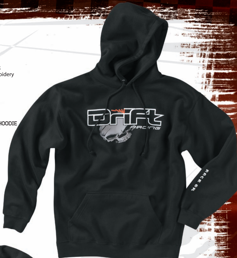
BIG D ZIP HOODIE 5215-56_*