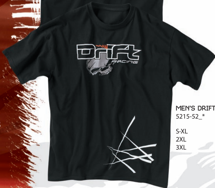
MEN'S DRIFT SKULL 5215-52_*