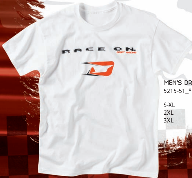
MEN'S DRIFT RACE ON 5215-51_*